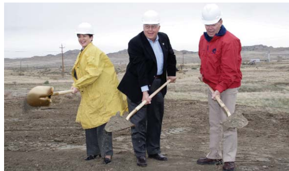
Representative Barbara Cubin, Senator Mike Enzi, and Senator Craig Thomas participated in the Center of Excellence ground-breaking at NPR-3.

The focus for the Center of Excellence will be on the best practices of the industry that ultimately increase recovery from U.S. reserves, specifically extending the life of stripper wells. The field will be equipped with state-of-